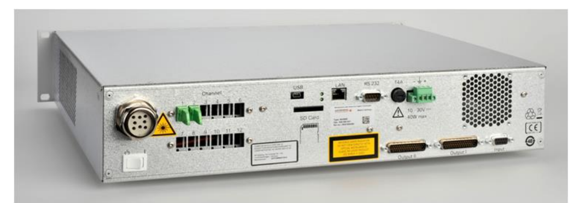
2-Channel Linear Power Series Instrument Integrated LAN & USB Interface, SD Card Reader and 20 Relays Output

In parallel, the AP Sensing Power Management Software Suite provides an easy to see "Graphical Thermal Profile" and logs all temperature traces into an SQL database for post processing and analysis.