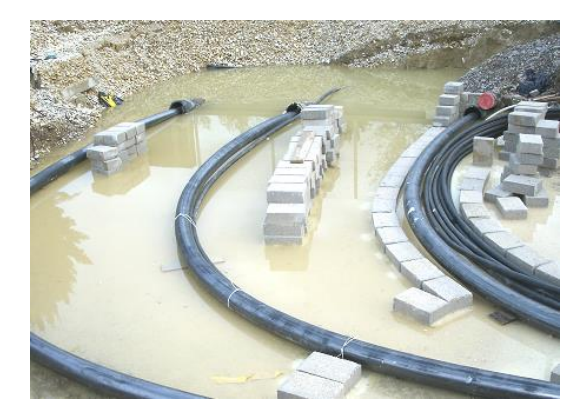
Road Crossing / Horizontal Drilling

In 2010 a new 380KV power circuit (north / south axis) was put into operation as part of a nationwide power grid improvement. Near Florence the high voltage circuit has buried sections in close proximity to a very populated valley and a historic church. The primary route was completed in trenches filled with thermal sand. The project also included challenging road crossings that used horizontal drilling to complete the construction.