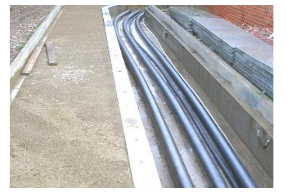
Cable Section in Trench